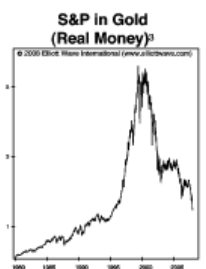
1. S&P priced in U.S.D. 2. S&P priced in terms of CRB Commodity Index. 3. S&P priced in ounces of gold. All chart data weekly through 1/22/08.